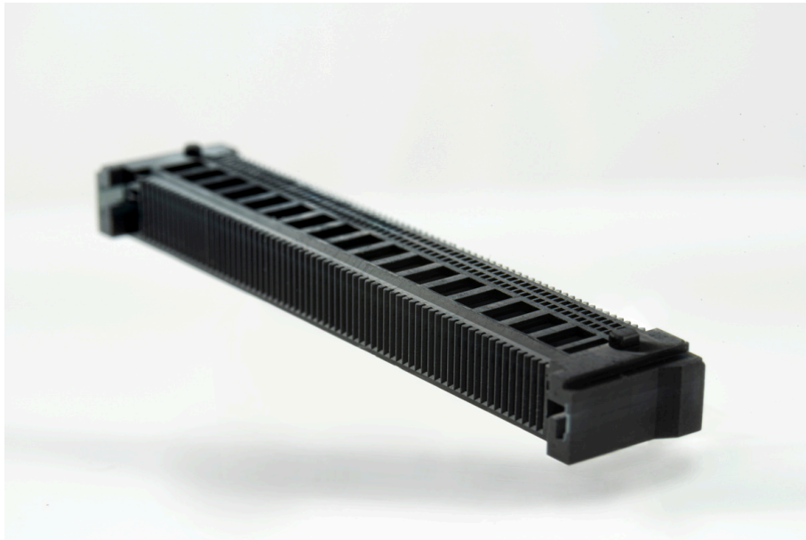
Prototype of an electronic connector printed on a BMF 3D printer

The final result? A production-ready prototype with functional internal flow, improved surface finish, and dimensional accuracy within \pm 10 \mu\text{m} —ready for in-vitro validation.