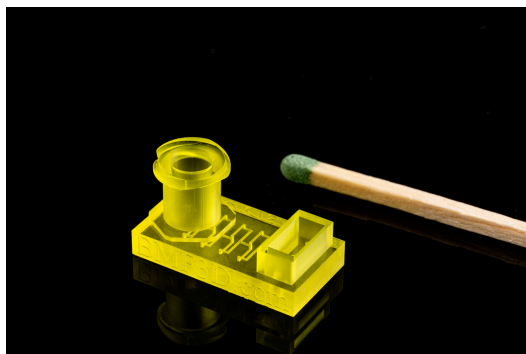
Prototype of an microfluidic chip with a luer lock printed on a BMF 3D printer

While some BMF materials offer optical clarity, 3D-printed surfaces may still contain micro-roughness or internal refractions that obscure inspection. If precise visualization is required (e.g., for bubble tracking or droplet manipulation), discuss surface finish requirements or post-processing options with BMF's applications team.